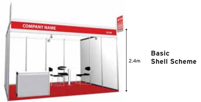
Basic Shell Scheme

Note: No financial credit will be given for any package item not utilised.