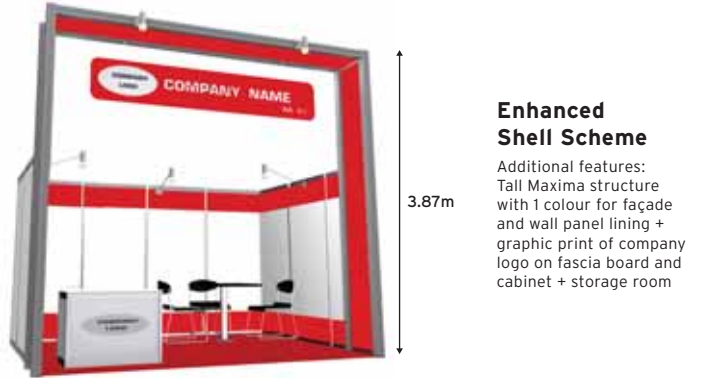
Enhanced Shell Scheme

Additional features: Tall Maxima structure with 1 colour for façade and wall panel lining + graphic print of company logo on fascia board and cabinet + storage room