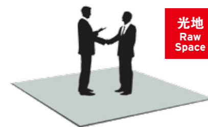
光地 Raw Space

光地展位提供您最大限度的设计空间, 全面个性化的体现企业形象! (18平方米起租) Fully customised construction offers unlimited possibilities to present your corporate image. (Min. 18 sqm)