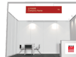
标摊 Standard Booth

标准展位为您提供全套基本设施, 让拎包参展变成可能! (12平方米起租) Basic booth package offers all you need to present your company at a reasonable price. (Min. 12 sqm)